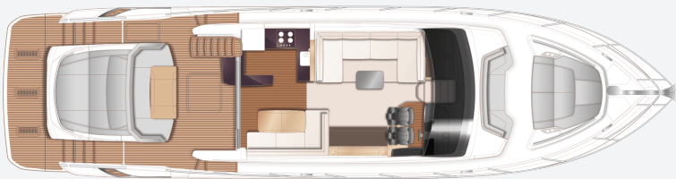
S62 Main Deck