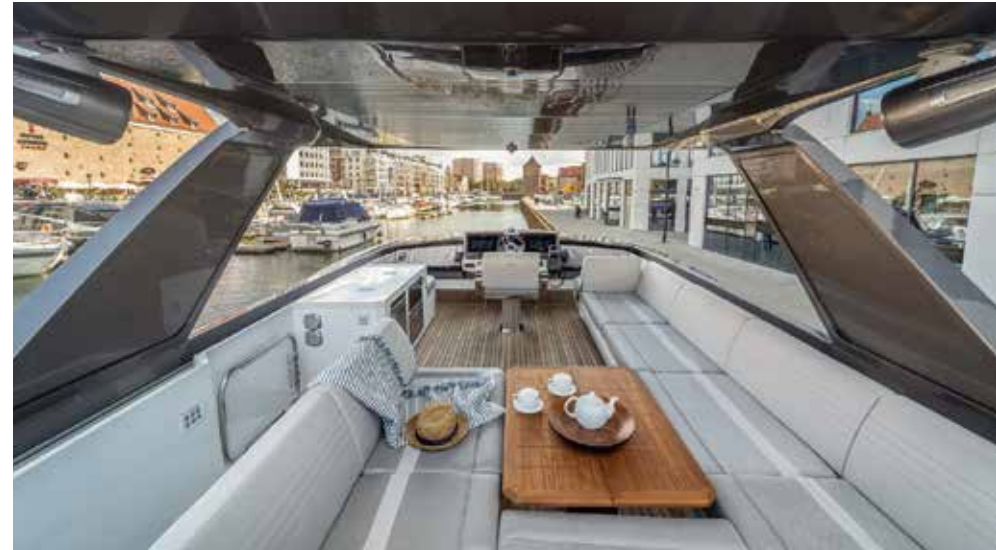
A dining settee on the flying bridge is an excellent spot to tuck into an alfresco meal.

T he 700 SKY is a perfect evolution for Galeon utilizing lightweight carbon fiber technologies and powerful engines to deliver stunning performance. Her design delivers more game changing features with an expandable bow and a few other surprises. Aboard you will find a light and welcoming salon with a luxurious finish while the expansive flybridge awaits your next party or family gathering.