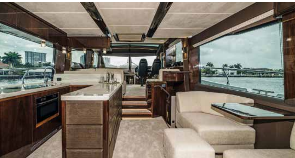
A centerline passageway through the salon makes for safe and easy transit even in a seaway.