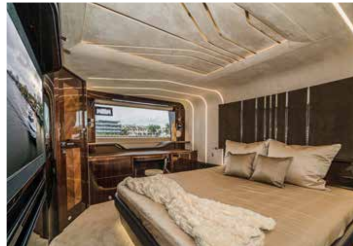
This enormous stateroom provides a comfortable and quiet oasis for the owner when it's time to get away.

Note: Layout and features may vary from shown here due to manufacturer consideration and client customization.