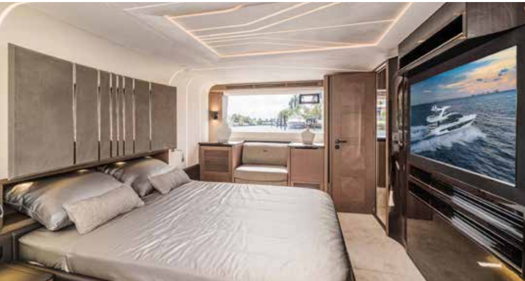
Massive hullside windows keep the 680 FLY's master stateroom bathed in lustrous natural light.