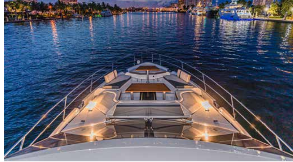
An enormous foredeck lounge features multiple settees and sunpads to help keep the party going.