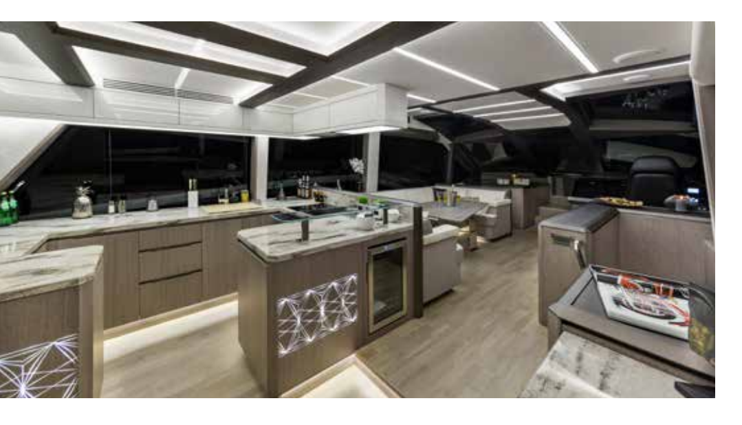
The aft galley on the main deck has an exceptional amount of counter space and stowage, both of which should please the chef.

he Galeon 640 FLY transcends mere form and function with stunning contemporary design and expertly hand-crafted interiors. This transformer yacht is revolutionizing the segment with its innovative approach to layout. With powerful Volvo propulsion systems and advanced electronics and controls, the Galeon 640 FLY will deliver experiences that create lifelong memories of times spent with friends and family. All with a style that will make its owner the envy of any port-of-call.