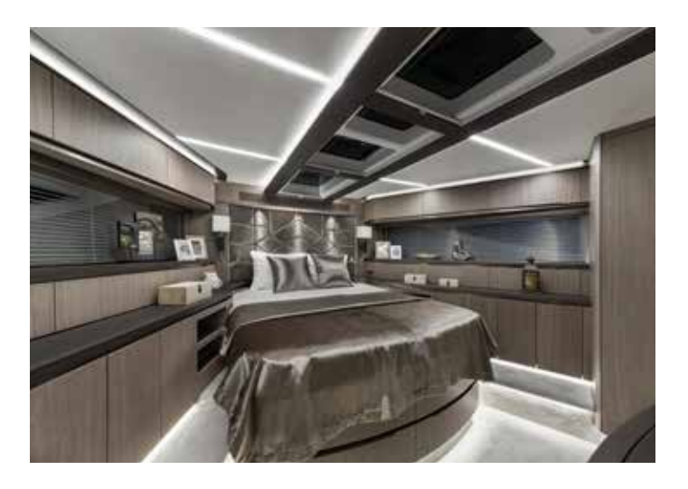
The level of fit and finish on the 640's accommodations level is unparalleled, and the stowage spaces are both plentiful and creative.

Note: Layout and features may vary from shown here due to manufacturer consideration and client customization.