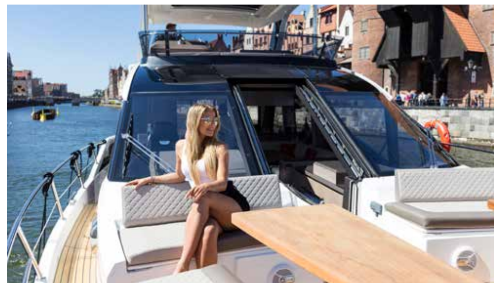
A fully loaded foredeck lounge is the best spot on the yacht to entertain guests far away from prying eyes.