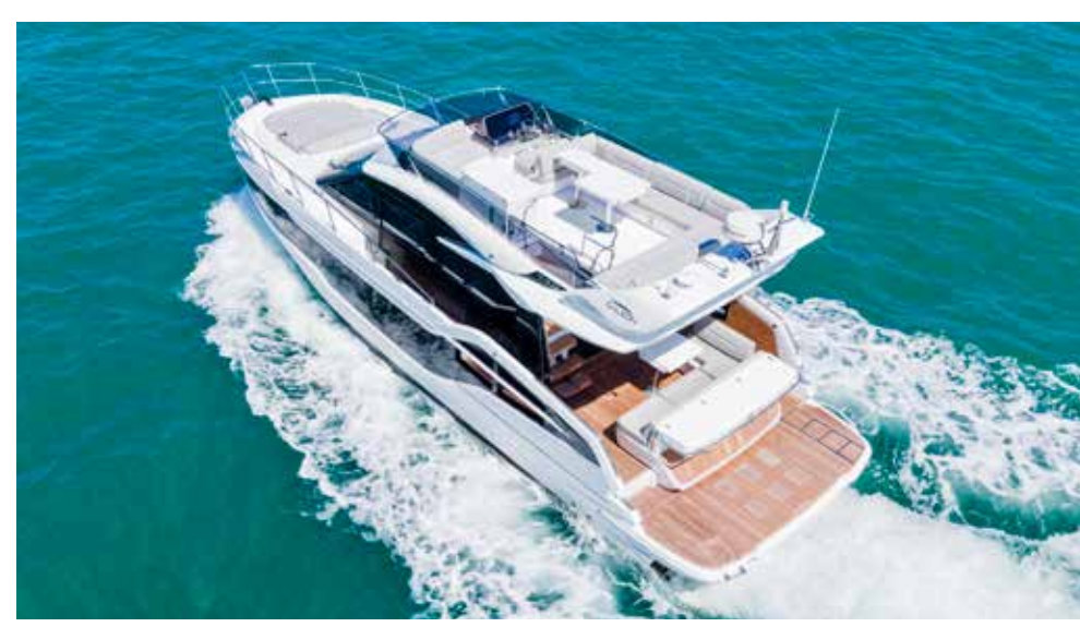
Galeon's signature Beach Mode adds more than 6.5 feet when the sides and rear platform are extended, making it the ultimate space to lounge and soak up rays while hovering directly above the water.