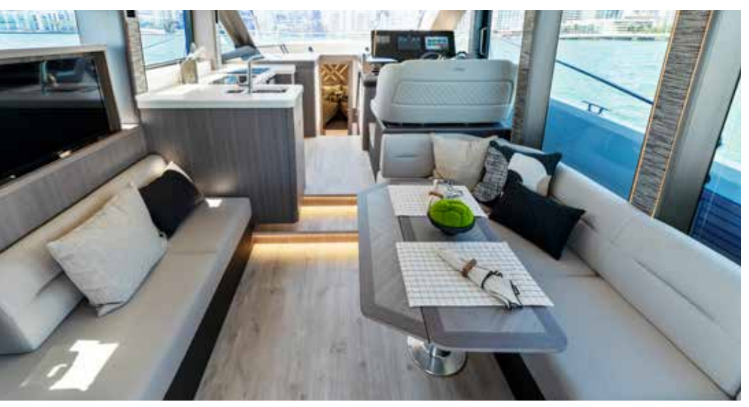
An elegant and spacious salon has plenty of comfortable seating to entertain many guests, while sizable windows allow ample natural lighting to brighten the area during the day.