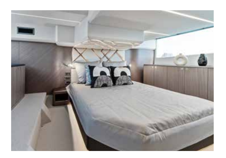
Relax in comfort in a luxurious master stateroom with generous storage space, ambient lighting options, and a private en-suite master bath.