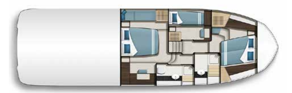
3-CABIN - STANDARD