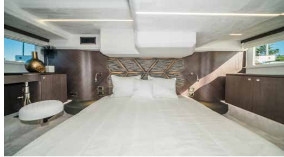
An amidships master is extra spacious thanks to its placement at amidships, which allows the stateroom to take full advantage of the yacht's beam.

B ased off the successful hull and sporty propulsion system of the 400 FLY, the 410 HTC offers a sportier silhouette matched with quality interior. Natural light is provided by large windows throughout as well as a sunroof overhead on the main deck. Everyone's favorite feature, "Beach Mode," expands the width of the cockpit deck creating more space for al fresco entertaining.