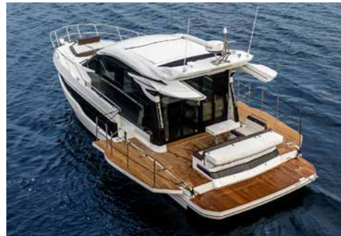
When "Beach Mode" is activated, two fold-out terraces greatly enhance the entertainment space in the after section of the main deck.

Note: Layout and features may vary from shown here due to manufacturer consideration and client customization.