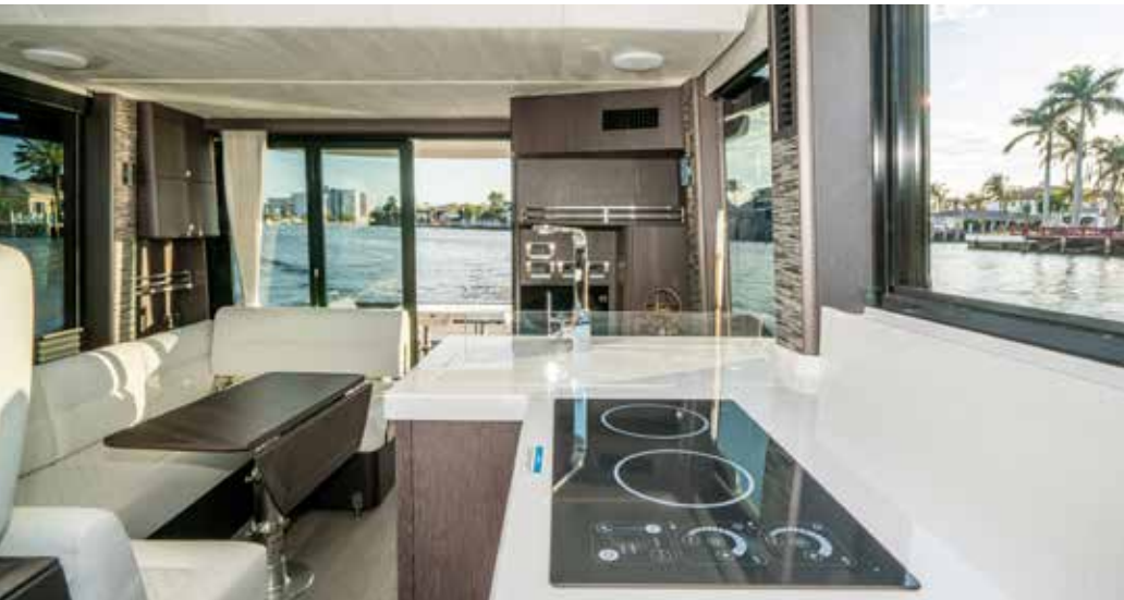
The choice to put the galley on the main deck allows the chef to remain a part of the party while preparing delicious meals for the guests.