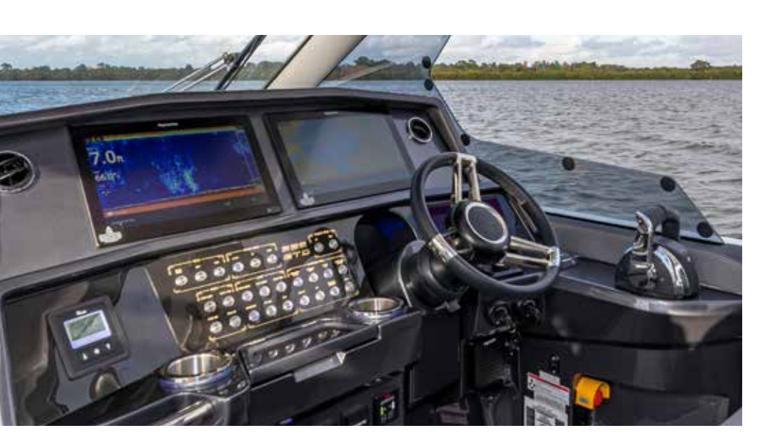
Inspired by high performance sports cars, the 325's helm is well appointed and ergonomically best in class by far.

he Galeon 325 GTO is the first in a collection of Grand Touring Outboard powered Galeons designed to astound, to amaze, and to excite your senses while enhancing your connection to the water. Her revolutionary design and features will have you expecting the unexpected.