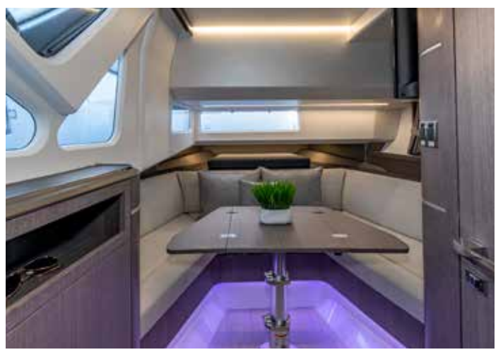
The cabin feels like that of a much larger Galeon yacht, plenty of natural light with best in class head.