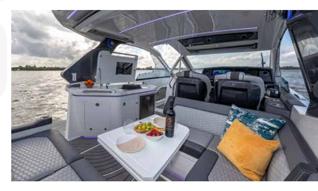
The cockpit is spacious and well appointed for entertaining day or night, lighting ambiance comes standard!